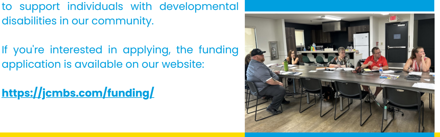
Supporting People with developmental disabilities through Advocacy, Resources, and Kindness!